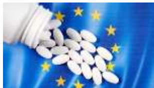
EU strategic resilience in pharmaceuticals