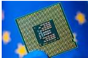
European Chips Act